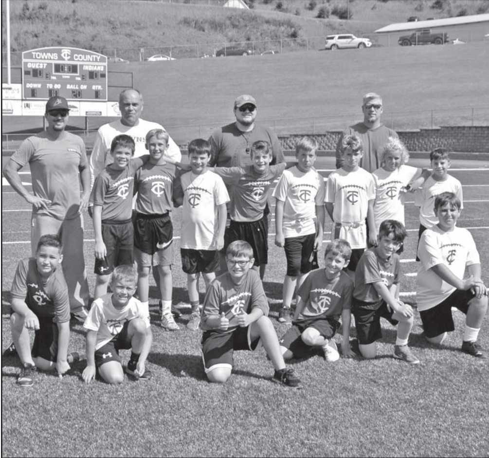
The Towns County youth during last Saturday's flag football debut at TCHS' Frank McClure Stadium.

Last week, teams reported for practice to the Foster Park football field in Young Harris on Tuesday, Sept. 7, followed by another practice on Thursday, Sept. 9. After only